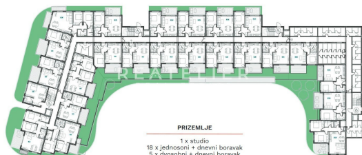
PRIZEMLJE 1 x studio 18 x jednosobni + dnevni boravak 5 x dvosobni + dnevni boravak 43 spremišta