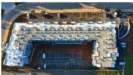
PRIZEMLJE natkriveni i vanjski parkirni prostor