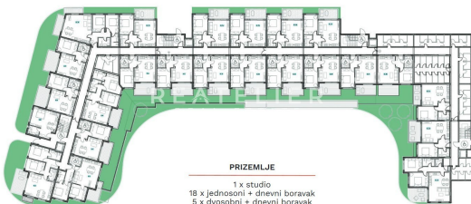
PRIZEMLJE 1 x studio 18 x jednosni + dnevni boravak 5 x dvosni + dnevni boravak 43 sporetna