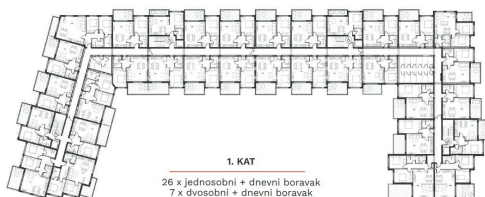
1. KAT 26 x jednosobni + dnevni boravak 7 x dvosobni + dnevni boravak 16 spremišta