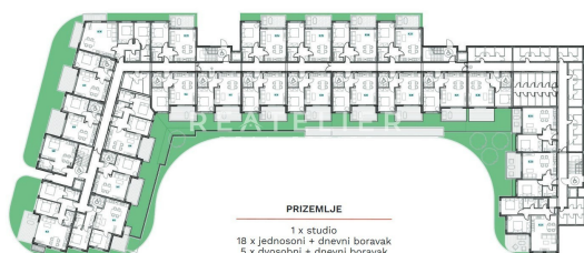
PRIZEMLJE 1 x studio 18 x jednosni + dnevni boravak 5 x dvosni + dnevni boravak 43 spremišta