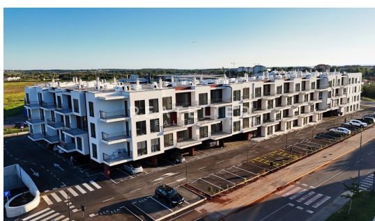
PRIZEMLJE natkriveni i vanjski parkirni prostor